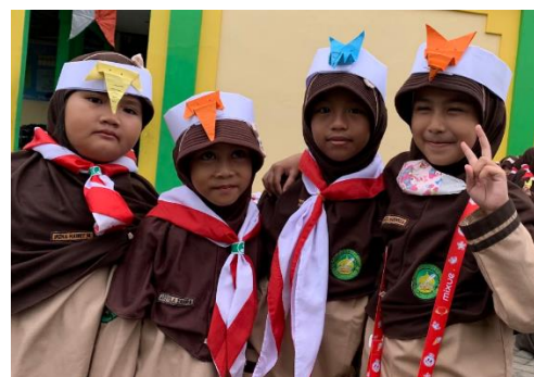
Figure 1 Siaga Scout Level 1

The selection of methods or approaches also considers time constraints and material availability, assisting in planning activities optimally. The implementation plan for Scout activities includes adjusting the curriculum to depict the stages of character development through Scout activities. SDIT Al-Mumtaz also has a Scout SIT training program for various student levels, designed according to the developmental level and understanding of students at each stage. Documentation of scout activities for Cub Scout-level or level 2 students at SDIT Al-Mumtaz can be seen in Figure 1.