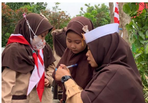
Figure 2 Interaction between Participants and Facilitators

Two-way communication is not just a means for exchanging information but also a key to strengthening the implementation of character values. With two-way communication between participants and facilitators, an atmosphere is created where character values can be more effectively applied. Students are not only given the opportunity to speak, ask questions, and express their views, but they are also encouraged to engage in active discussions, creating an environment where character values can penetrate into their daily lives more deeply.