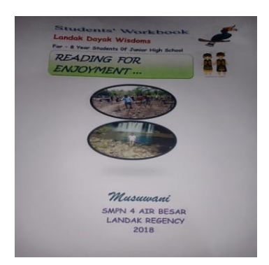
Figure.2. Cover of Product Notes : Images : A pairs of Dayak people, Dayak Nugal, hornbill, Manangar waterfall. Letters : students'workbook, Landak Dayak wisdoms,for -8 year students of junior high school,Reading for Enjoyment, musuwani,SMPN 4 Air Besar, Landak regency

for Enjoyment' must be atractive and colorful. To design the cover, researcher try make in agood image based on the culture of Landak regency likes : apairs of boy and girl of dayak people, the activities of dayak in doing Nugal at their farm also one of the famous scenary that haven in landak regency. Landak mascot is hornbill (burung Enggang) put on right top of the cover. The cover are below :