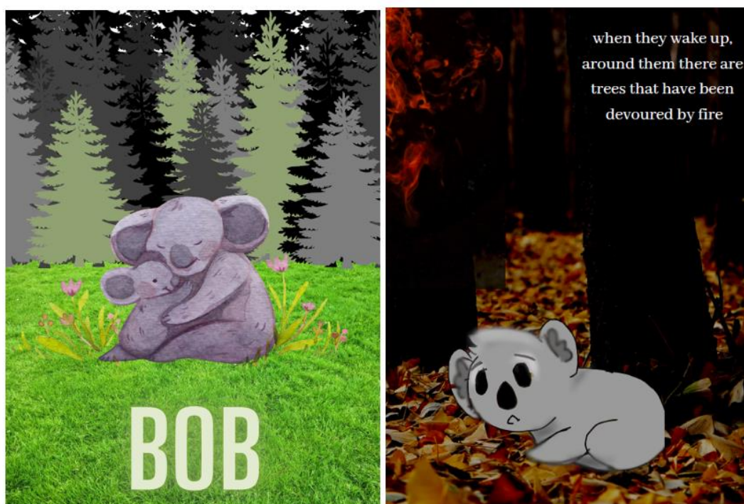
Figure 2. Excerpts from the story “Bob” depicting Australian wildfire

Another issue raised in the projects was habitat destruction related to economic development. The story “Where does the little squirrel go?” depicts the tension between animal habitat and the destruction of forest for development. In this picture book, the main character, the squirrel, faced the reality of almost losing his tree home when a bulldozer prepared to bulldoze the forest to clear the ground for building. The writers emphasized the role of humans and their machinery advancement in the destruction of the environment and its natural habitats.