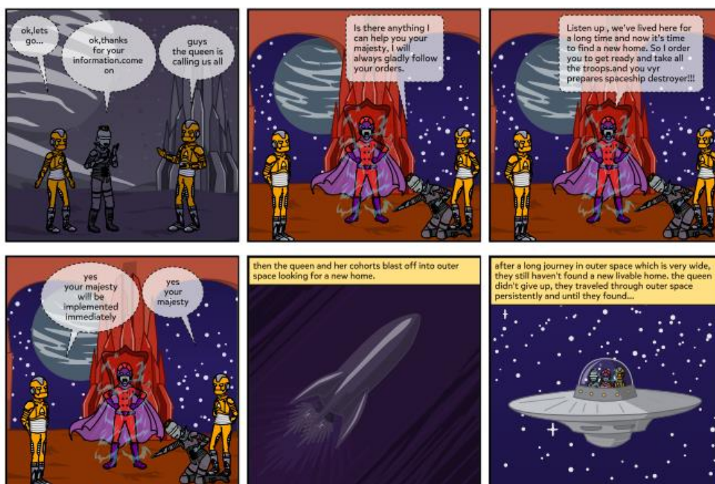
Figure 2. Student's Digital Comic Projects entitled "Space Attack."

topic. In addition to having collaboration inside the classroom, the participants were encouraged to continue their discussion online via synchronous and asynchronous modes. In the second onsite meeting (teacher feedback), the participants showed their first draft to the lecturer to obtain feedback. After getting feedback from the lecturer, the participants carried on their projects through online collaboration. From the online collaboration, the participants could revise and improve their projects to be prepared for the presentation in the next onsite meeting. In the third onsite meeting (presentation), the participants presented their projects to the whole classroom. In the fourth onsite meeting (peer feedback), the participants obtained constructive feedback from their peers. Then, the participants revised their projects via online collaboration. In the last onsite meeting, the participants submitted their projects to the lecturer. One of the student's digital comic projects can be perceived in Figure 2.